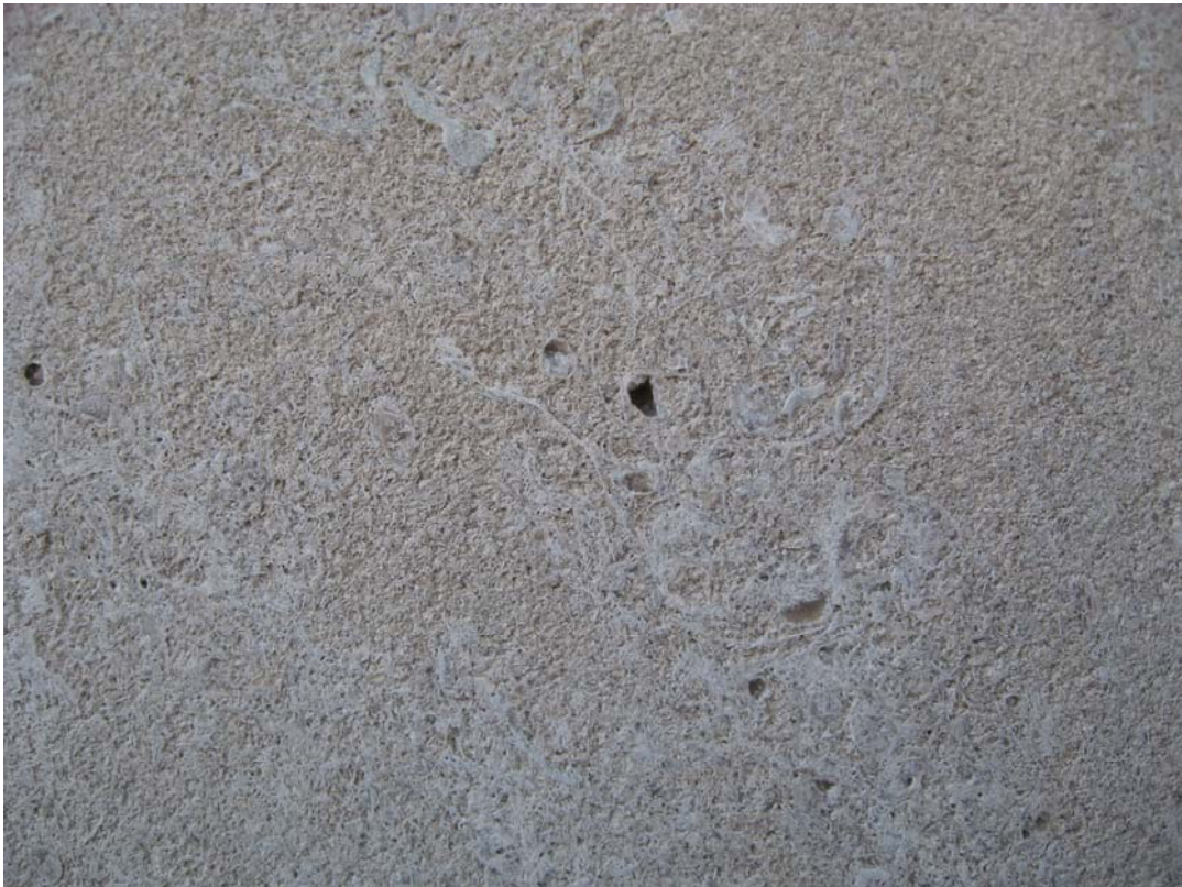
Close-up of the Boone limestone facing the exterior of the Capitol.