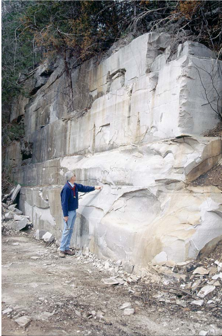
Limestone quarry for State Capitol in the Boone Formation at Pfeiffer, Arkansas.

The rocks used in the construction of the Arkansas State Capitol can be grouped into three general categories (as all rocks can); igneous – rock formed from molten material; sedimentary – rocks formed from the bits and pieces weathered from other rocks or from the shells and skeletons of plants and animals that lived in the past; and, metamorphic – rocks formed from preexisting rocks by heat, pressure or chemical action.