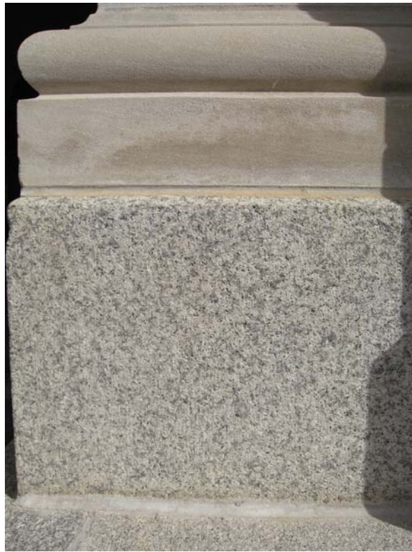
The igneous rock syenite at the base of a limestone column.

If you stop a moment and give close attention to the limestone facing the Capitol you can find many recognizable fossil fragments. Disc-shaped crinoids, lacy bryozoan and cone-shaped corals are all present.