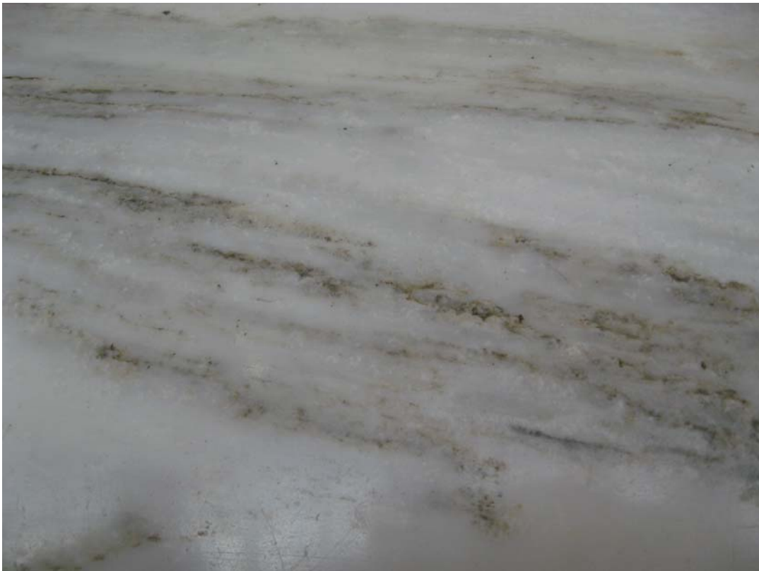
Indistinct dark zones in marble in the interior of the capitol.

The marble used inside the Capitol is a metamorphic limestone and was imported from Alabama, Colorado and Vermont. The original limestones, before metamorphism transformed them into marbles, may have looked similar to limestone from the Boone Formation and were probably formed in much the same manner and by similar processes. Metamorphism slowly destroyed the original texture, bedding and fossils of the limestone and led to recrystallization and reestablishment of environmental equilibrium. The indistinct dark zones observed in this marble may be the last traces of folded bedding planed or possible zones of impurities concentrated by pressure solution.