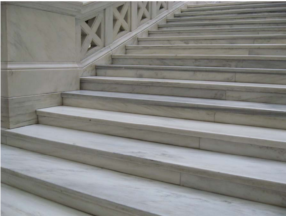
Marble stairs in the state capitol building.

Typical of many public buildings the interior of our Capitol is faced with marble. Marble is used for its beauty, durability, uniformity of texture and adaptability to construction.